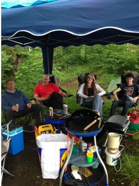
Relaxing the night before the climb!